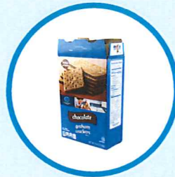
Cereal Boxes & Other Paperboard