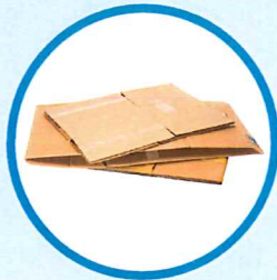
Cardboard Boxes (Please Flatten)