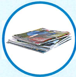
Magazines/ Soft Cover Books