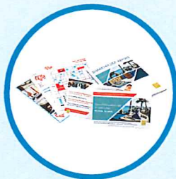
Flyers & Postcards