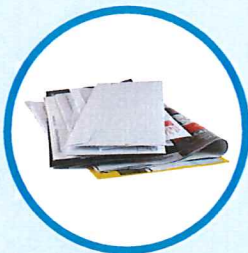
Envelopes & Junk Mail